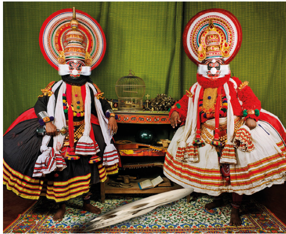
Vivek Vilasini, Ambassadors after Hans Holbein , 2008, photographic work, 127.4 x 168cm, FPS Foreign Affairs collection, installed at the official residence of the Belgian Ambassador in New Delhi.